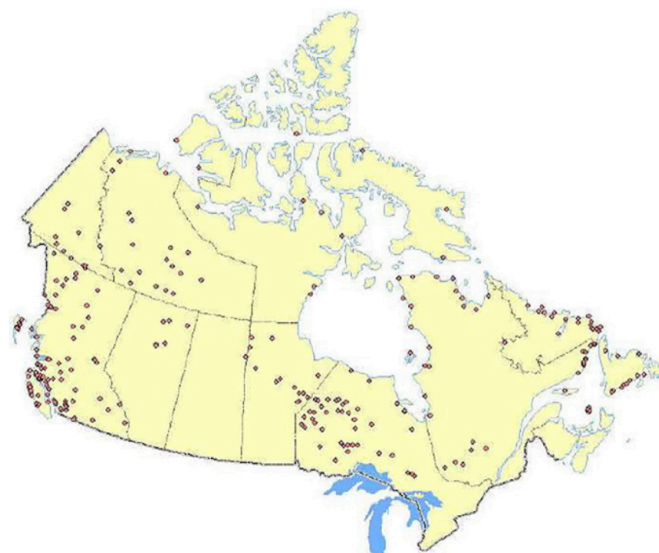
A Map Showing the Locations of Remote Communities in Canada