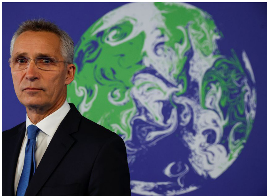
NATO Secretary General Jens Stoltenberg poses for a picture during the UN Climate Change Conference (COP26) in Glasgow, Scotland, UK, November 2, 2021.

Stoltenberg, a former U.N. special envoy on climate change, said work had already started